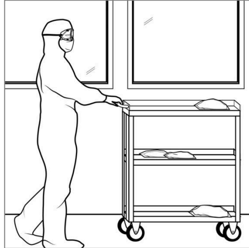
Pass through lower classed areas.