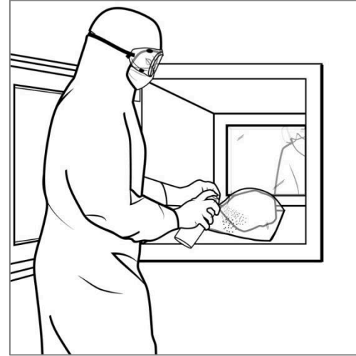
Surface sanitize before passing through to ISO5 area.